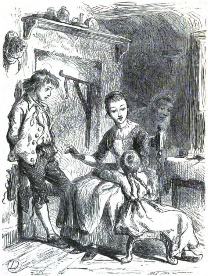
“ Once upon a time, when Saint Nicholas was on the earth.”—p. 48.